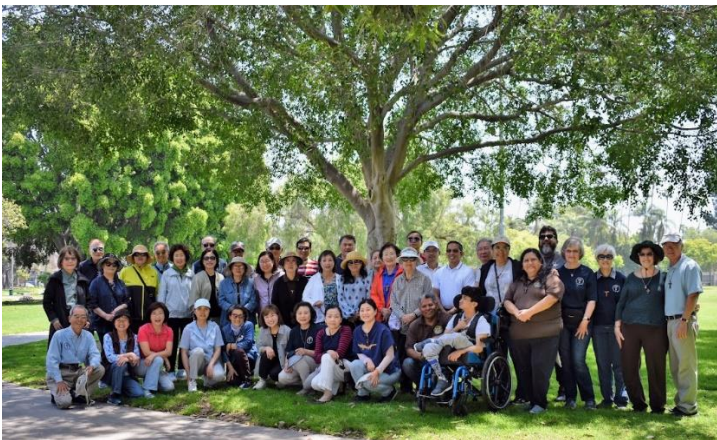
Group photo of all who came!

Here are all the photos from our District Picnic.