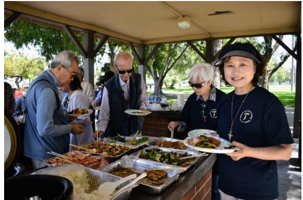
Lots of food!

https://photos.app.goo.gl/69rZRx1hqPvzNJPP7