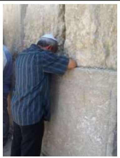
THE WALL OF LAMENTATIONS