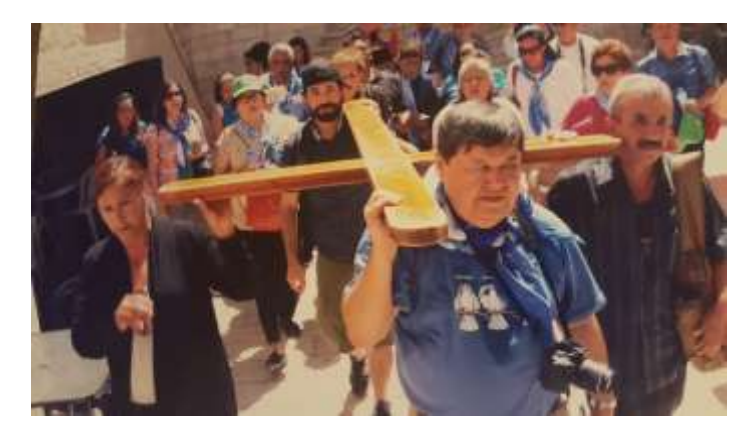
THE WAY OF THE CROSS