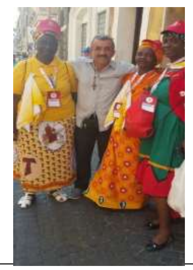
IN ROME WITH FRANCISCAN SISTERS FROM AFRICA