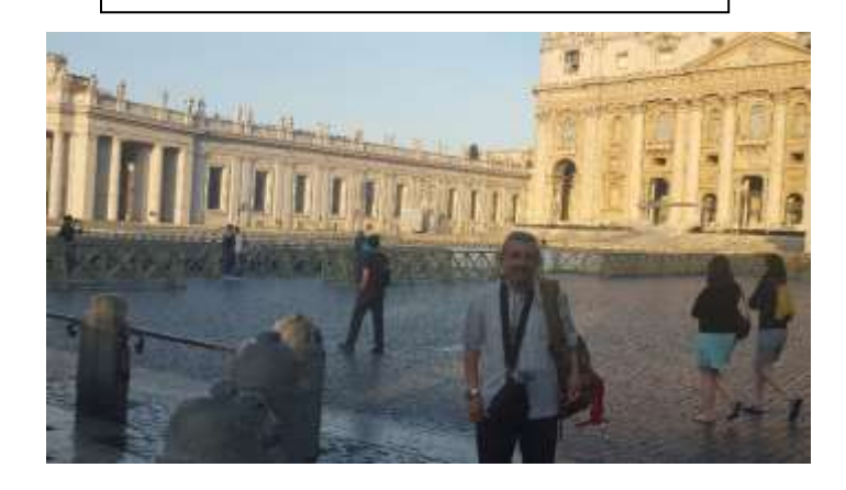
SAINT PETER'S CHURCH