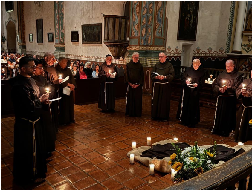
Transitus at Mission San Luis Rey on October 3rd

Some members of St. Maximilian Kolbe Fraternity traveled to the Franciscan parish in Hermosa Beach, and others to Mission San Luis Rey to participate in the Transitus celebrations on October 3rd.