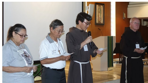
Multi-lingual Closing Prayer