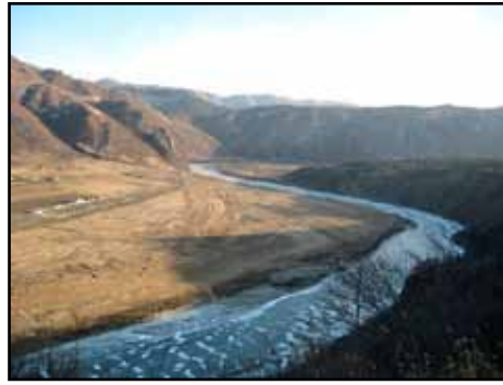
Tuman River, between North Korea on the left, and China on the right.