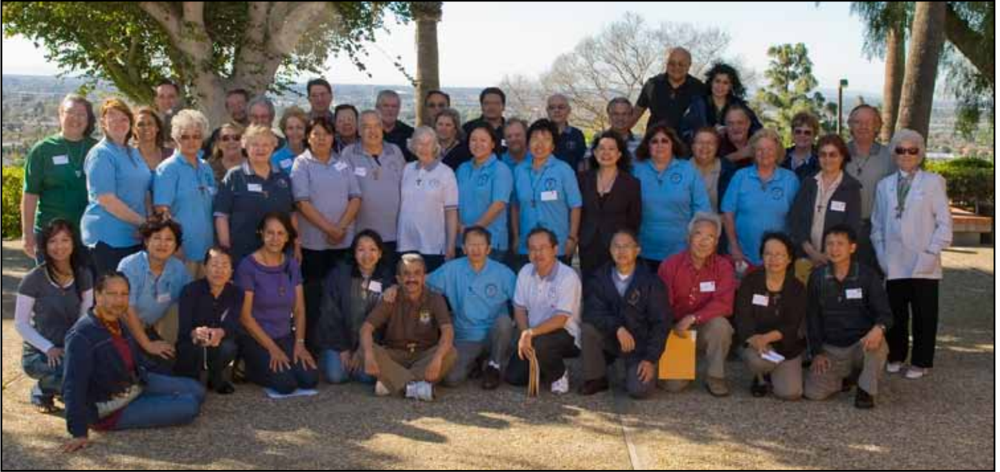
Assembled Ministers and the Regional Executive Council of the St. Francis Region at the Ministers' Meeting and Regional Election, January 16-18, 2009

All of the ministers of St. Francis Region (or their delegate) gathered from January 16-18, 2009, at Marywood, for a Chapter of Elections (the annual ministers' meeting).