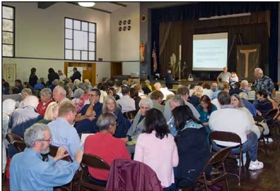
Regional Gathering at St. Gregory's Parish in Whittier, CA., October 5th, 2008.